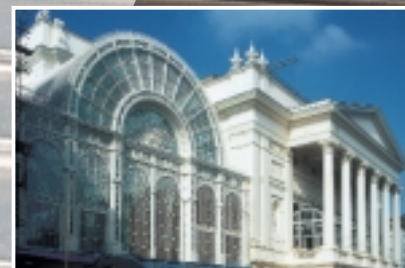
Royal Opera House, London.