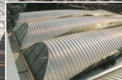
Leisure centre, London.