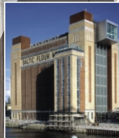
Baltic centre, Gateshead.