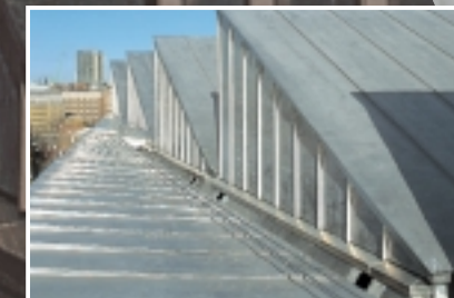
Royal Opera House, London.